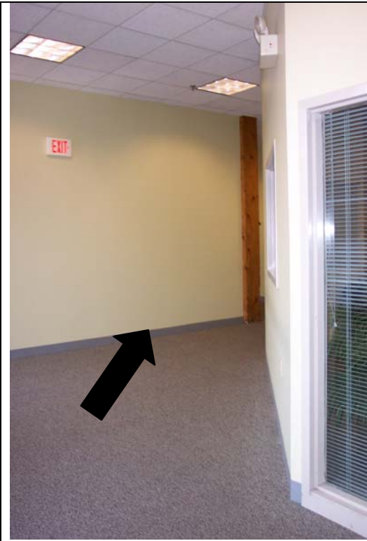
6-And down the hall