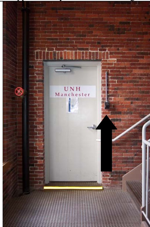
9-You have reached the back entrance of UNH Center for Graduate & Professional Studies. You will need a keypad code to use this entrance. Codes can be obtained from the Reception/Security Desk at 400 Commercial Street, 1 st Floor.