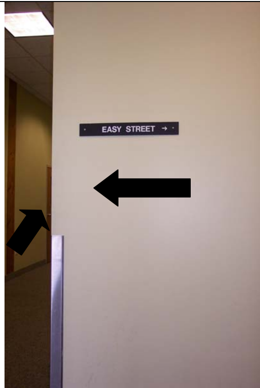
7-Opposite Easy Street – Take a right.